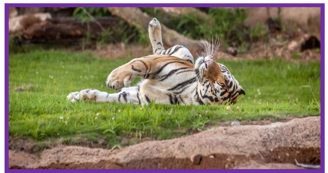
IRA Charitable Rollover Now Permanent