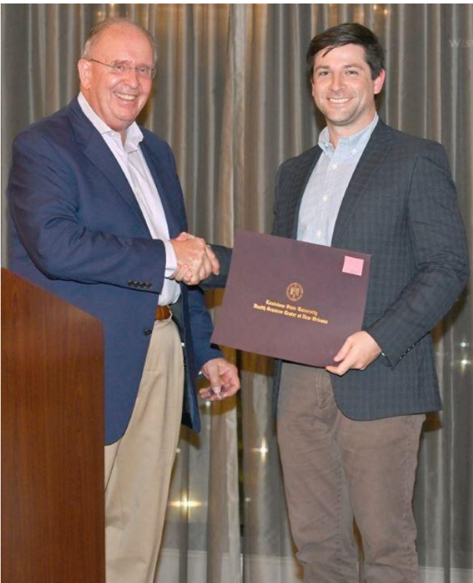
Presentation of the OMS Residency Certificates to the outgoing chiefs